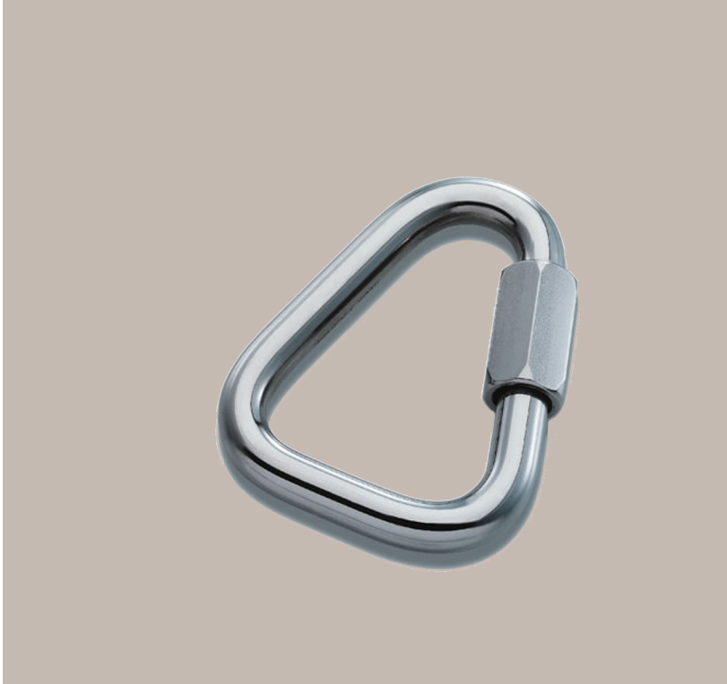
Delta Maillon Rapide connector

Product Code: DZ10 Conformance: BS EN 362 BS EN 12275 Gate Opening: 12mm Breaking Strength: 45kN Material: Zinc Plated Steel Weight: 153 grams