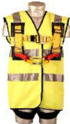
ABJ - INTEGRAL HI-VIS