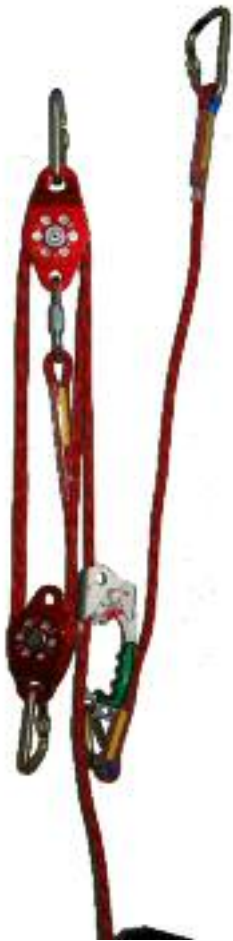
Vertical Work and Rescue System - Pre-Rigged pulley system for self rescue, raising and lowering