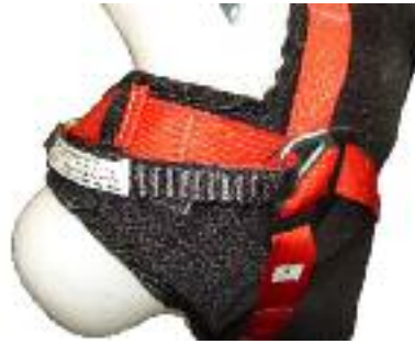
Elite 30cm extension strop