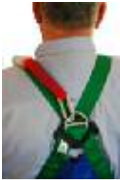
ABLSS - RESCUE STEP