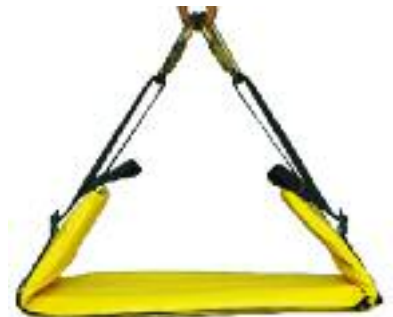
ABBS - BOSUNS SEAT