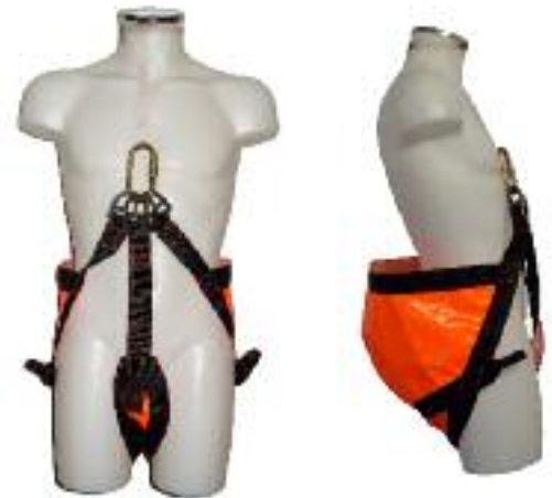
RESCUE HARNESS (NAPPY)