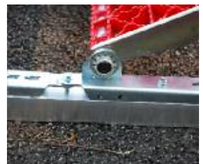
pictured: 1.5m Narrow Step System c/w Handrails