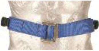
ABMB - MINERS BELT