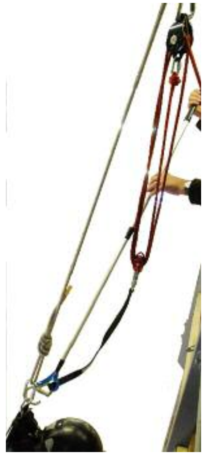
Vertical Rescue System - reach pole and pre-rigged pulley system.