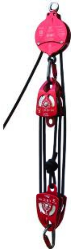
Rescue Hauler Pulley - 2 way auto locking. 5:1