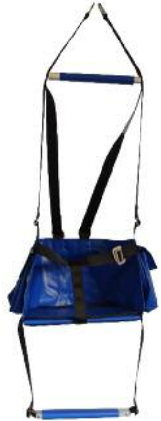
ABBC - BOSUNS CHAIR