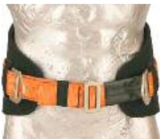
ABWP - WORK POSITIONING BELT